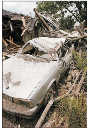
A car which was damaged by Hurricane Katrina.

Some people are angry at the government. They say that the government worked too slowly. It took too much time to get help to the victims. "A lot of people are playing the blame game," said President Bush. He said he will look into why the help took so long to come. However, helping the victims comes first.