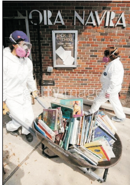
Cleaning up a school after the hurricane.

Engineers from the army worked to fix the walls around